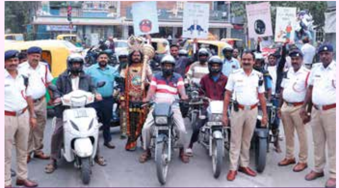
Fortis Hospital, Bannerghatta Road