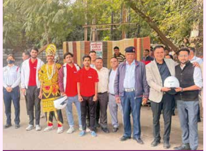
Fortis Hospital, Vasant Kunj