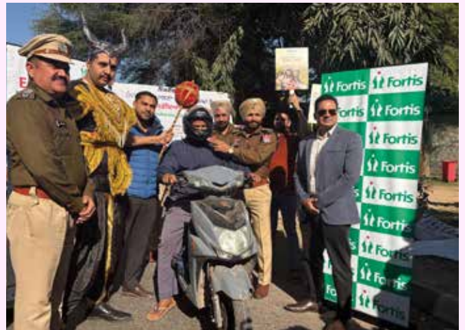
Fortis Hospital, Mohali