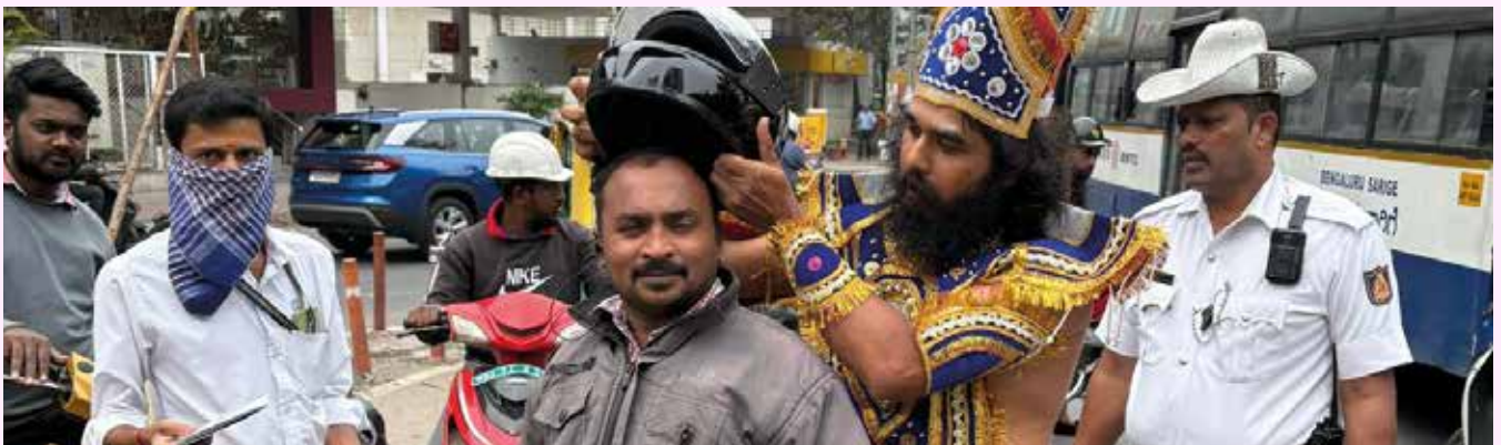
Fortis Hospital, Rajaji Nagar