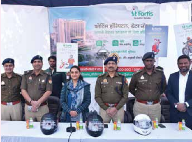
Fortis Hospital, Greater Noida