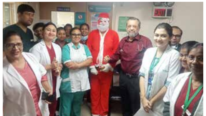
Fortis Hospital & Kidney Institute, Kolkata