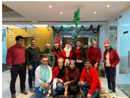
Corporate Office, Gurugram