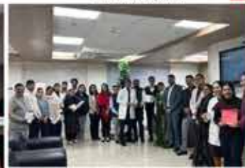
Fortis Hospital, Nagarbhavi