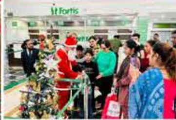
Fortis Escorts Heart Institute, Amritsar