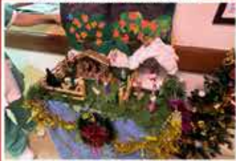
Fortis Hospital, CG Road, Bangalore