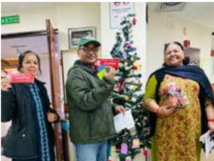
Fortis Escorts, Faridabad