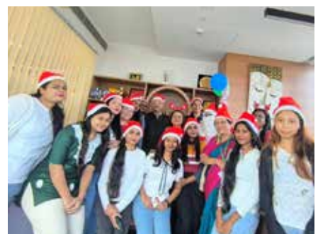
Fortis Hospital, Anandapur