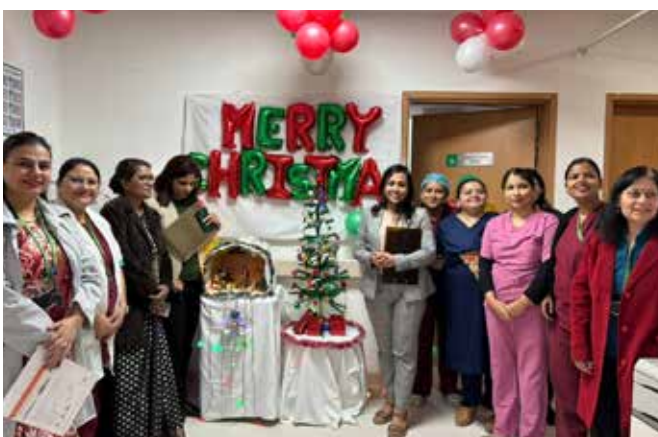
Fortis Memorial Research Institute