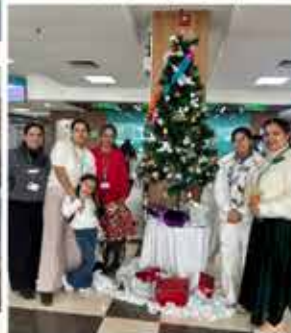
Fortis Hospital, Ludhiana