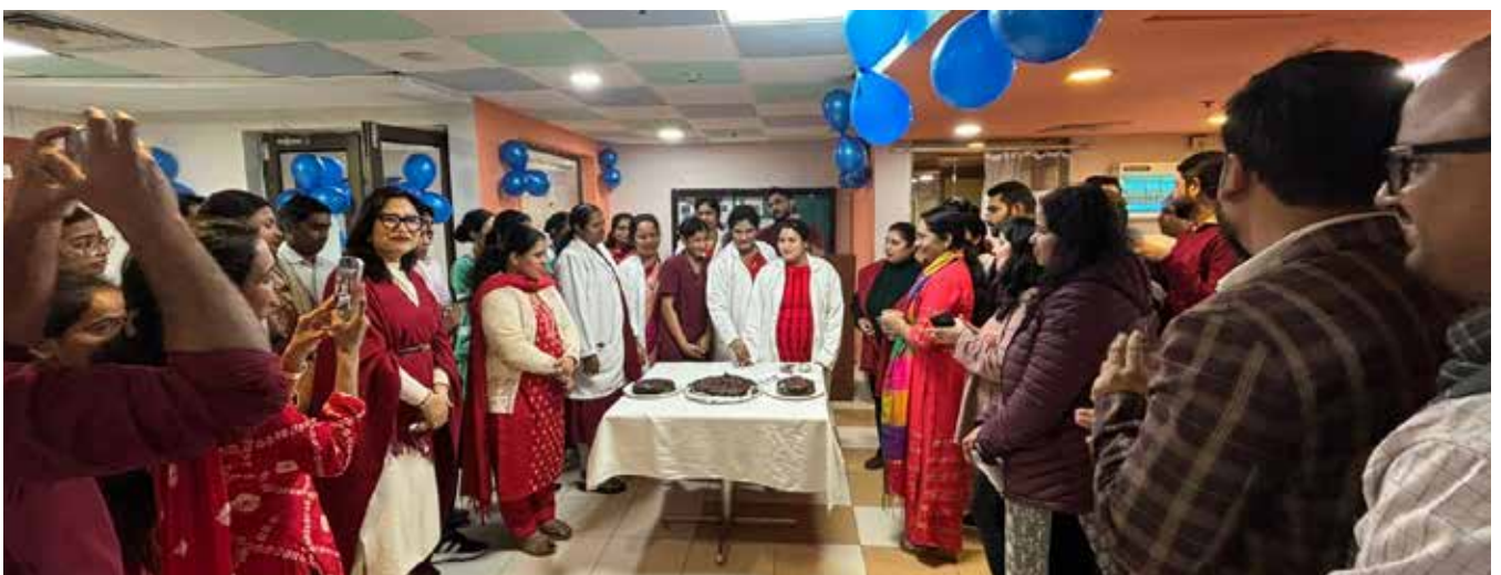
Fortis Hospital, Vasant Kunj