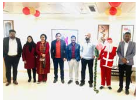
Fortis Hospital, Greater Noida