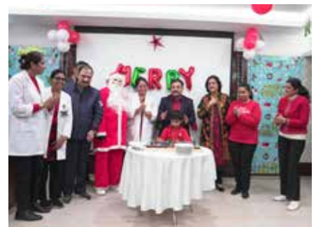
Fortis Hospital, Shalimar Bagh