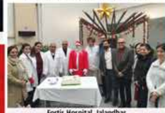
Fortis Hospital, Jalandhar