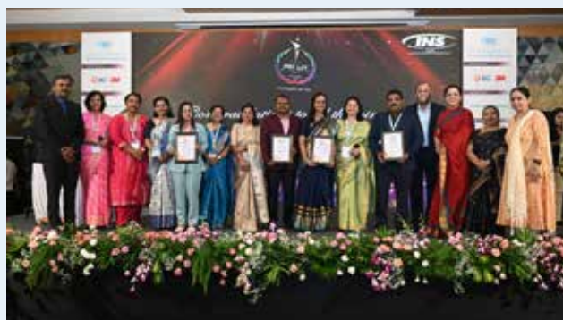
The Fortis team at the awards ceremony

Nurses from three Fortis hospitals have won prestigious awards at the 13th Infusion Nurses Society (INS) Conference held on November 7-8, 2025, in Pune.