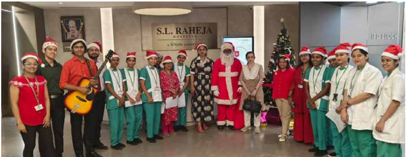
Fortis SL Raheja Mahim