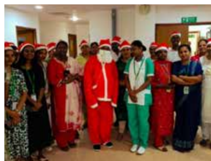
Fortis Hospital, Bannerghatta Road