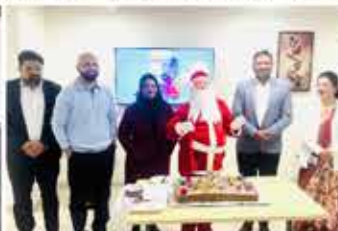
Fortis Hospital, Greater Noida