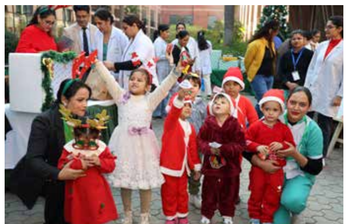
Fortis Hospital, Mohali