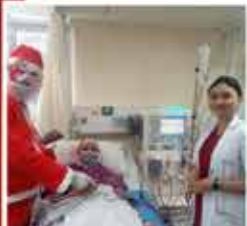
Fortis Hospital and Kidney Institute, Kolkata