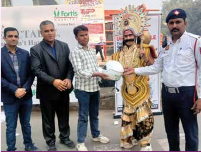
Fortis Hospital, Shalimar Bagh