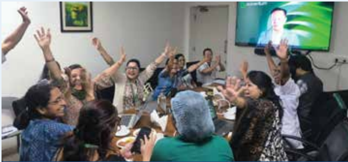
Team Anandapur celebrates a landmark victory at WHO QIP 2025