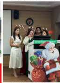
Fortis Hospital, Manesar