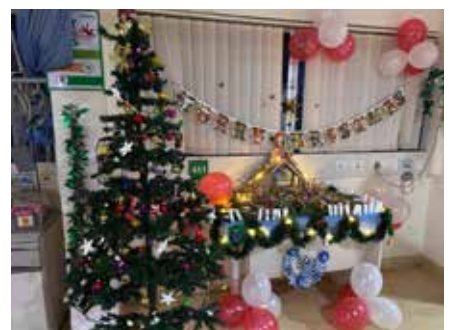
Fortis Hospital, CG Road