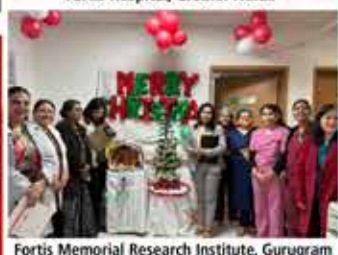
Fortis Memorial Research Institute, Gurugram