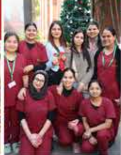
Fortis Hospital, Mohali