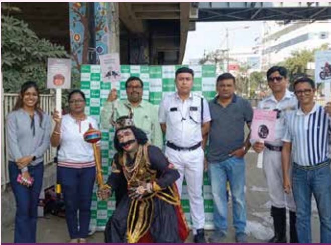
Fortis Escorts Hospital, Anandapur