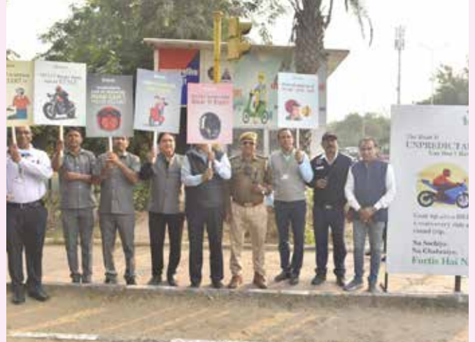
Fortis Hospital, Jaipur