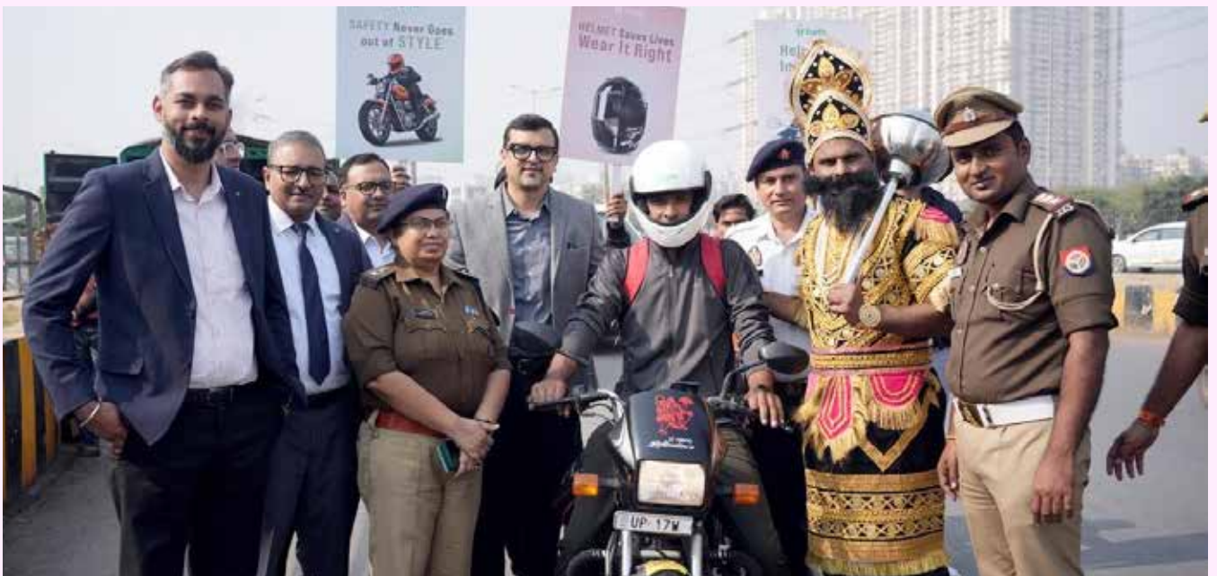
Fortis Hospital, Noida