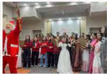
Fortis Escorts Heart Institute, Okhla Road