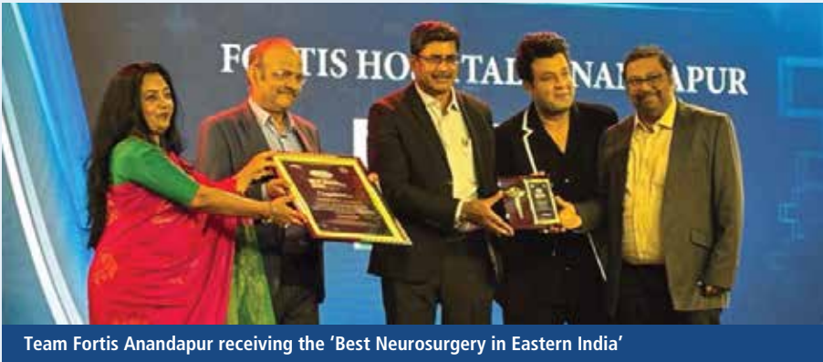
Team Fortis Anandapur receiving the 'Best Neurosurgery in Eastern India'

Fortis Hospital, Anandapur has received the prestigious 'Best Neurosurgery in Eastern India' award at the ET Health Conclave & Business Summit 2025, held on December 9, 2025.