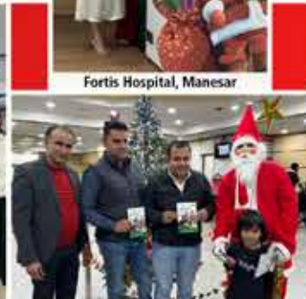
Fortis Escorts Hospital, Jaipur