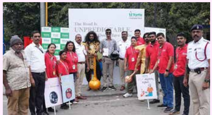
Fortis Hospital, CG Road