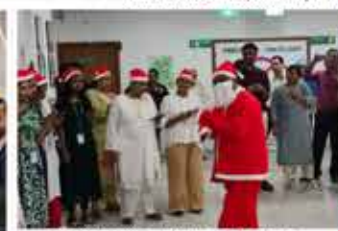
Fortis Hospital, BG Road, Bangalore