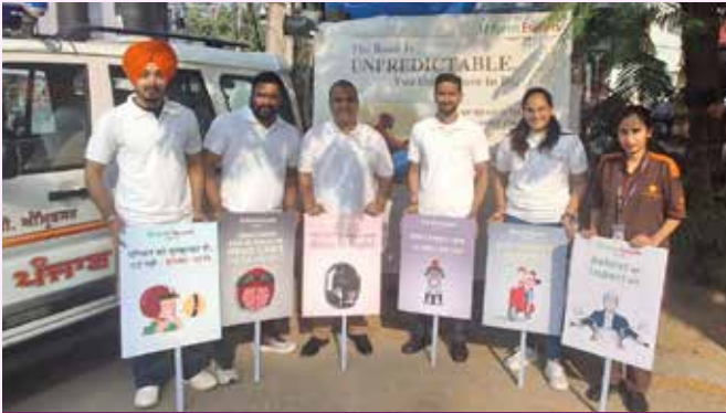
Fortis Hospital, Amritsar