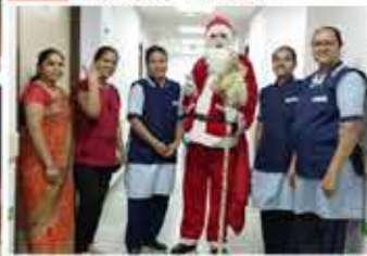
Fortis Hospital, Kalyan