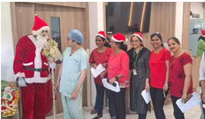
Fortis Hospital, Kalyan