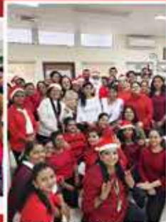
Fortis Hospital, Mulund