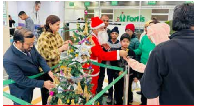
Fortis Escorts Hospital, Amritsar