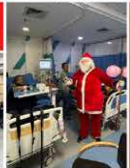
Fortis Hospital, Vasant Kunj