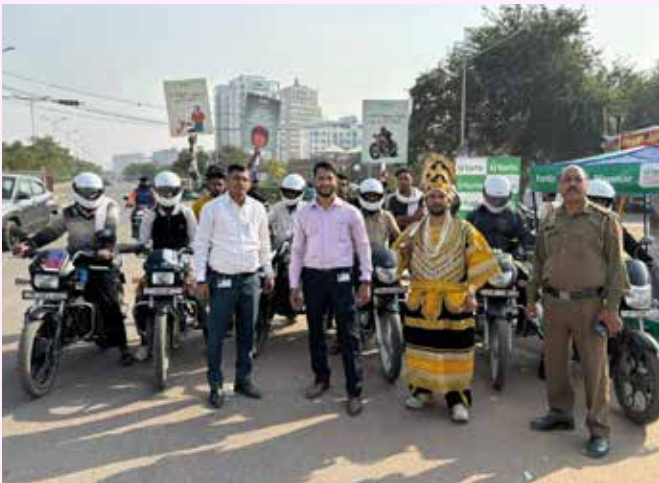
Fortis Hospital, Manesar