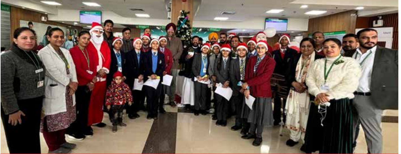
Fortis Hospital, Ludhiana