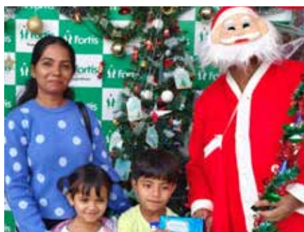
Fortis Hospital, Nagarbhavi