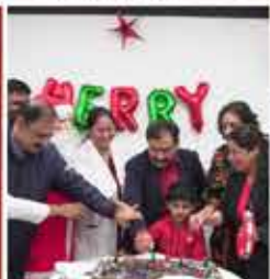
Fortis Hospital, Shalimar Bagh