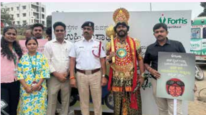
Fortis Hospital, Nagarbhavi