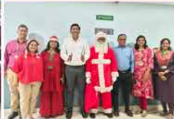
Fortis SL Raheja Mahim