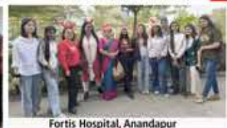
Fortis Hospital, Anandapur