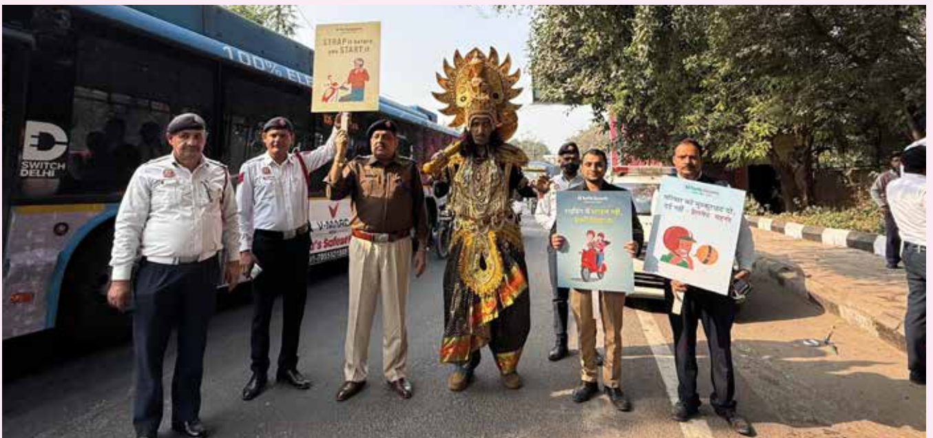
Fortis Escorts Heart Institute