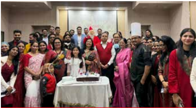
Fortis Escorts Heart Institute