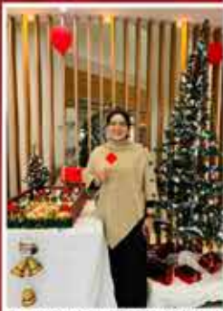
Fortis Escorts Hospital, Faridabad