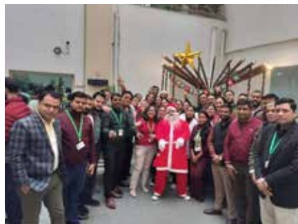
Fortis Hospital, Jalandhar