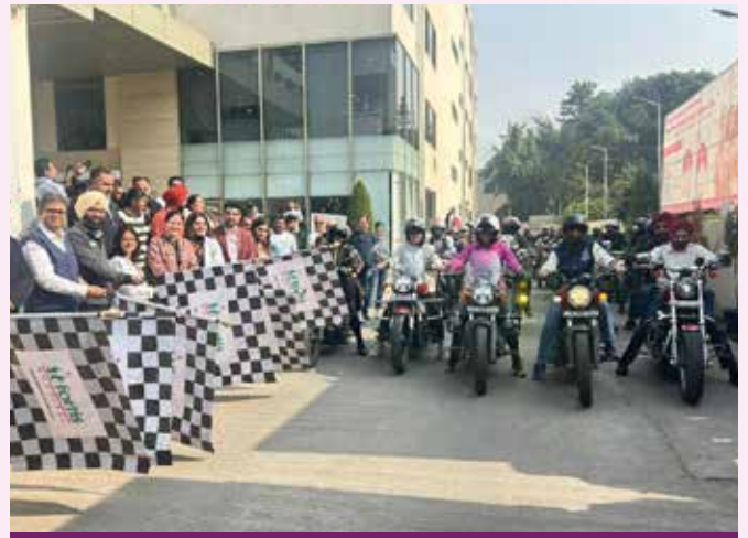
Fortis Hospital, Mall Road Ludhiana