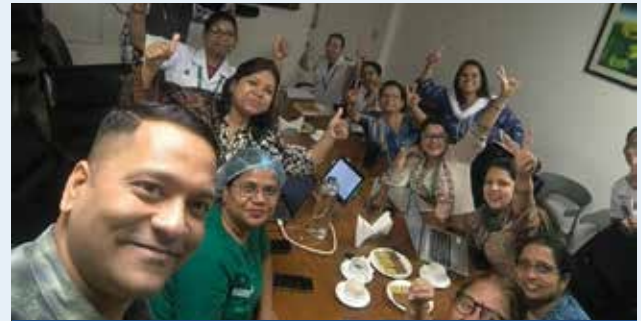
Pride, unity & celebration after Fortis Anandapur's WHO QIP Distinction win

Fortis Hospital Anandapur, Kolkata, has been honoured as the Distinction Winner in the prestigious WHO QIP Project 2025 for the initiative titled 'Optimizing Standards of Implants, Load Monitoring and Loaner Sets Reprocessing for Enhancing Patient Safety.' This highly acclaimed global project saw participation from 10 countries, with only nine hospitals from India selected.