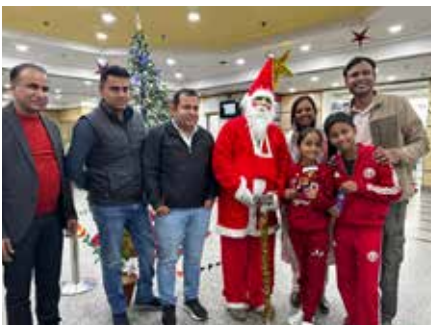
Fortis Hospital, Jaipur