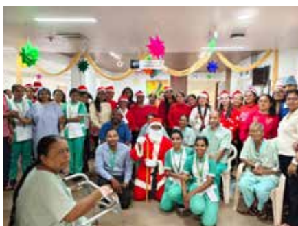
Fortis Hospital, Mulund