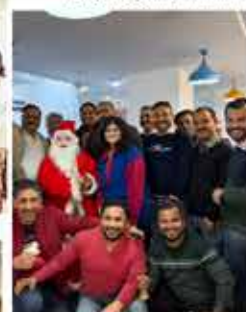
Corporate Office, Gurugram