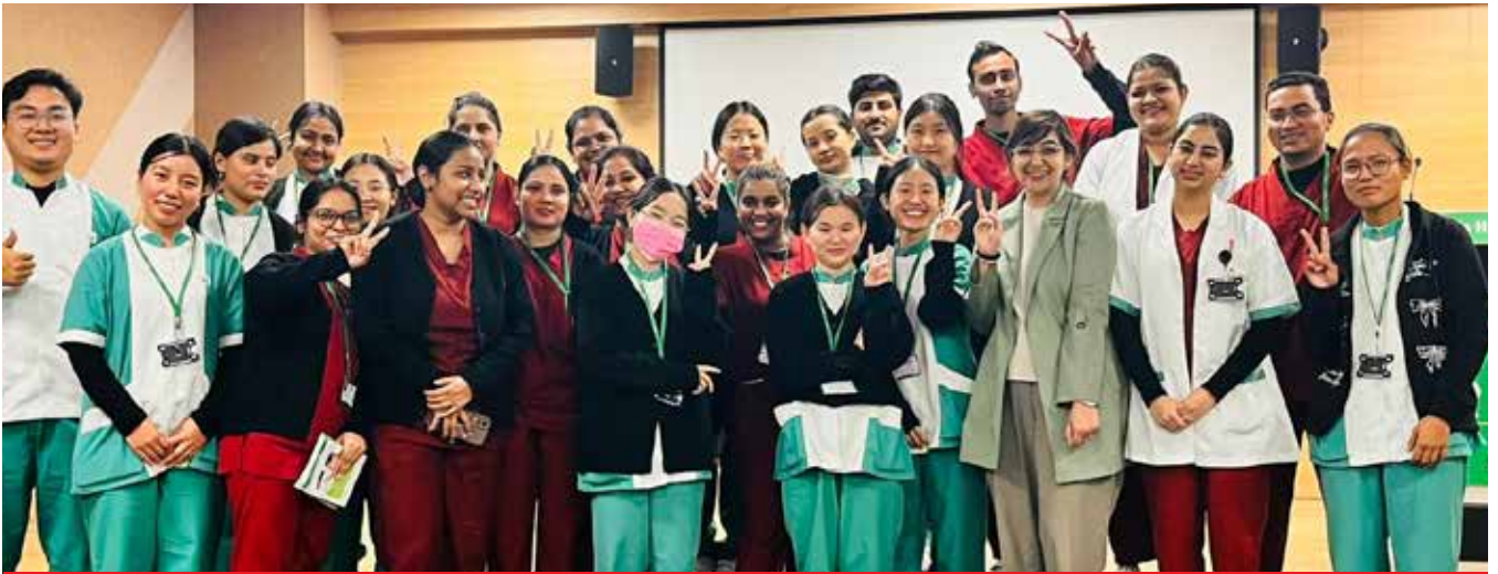
Fortis Hospital, Manesar